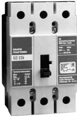
Typical G-Frame Circuit Breaker